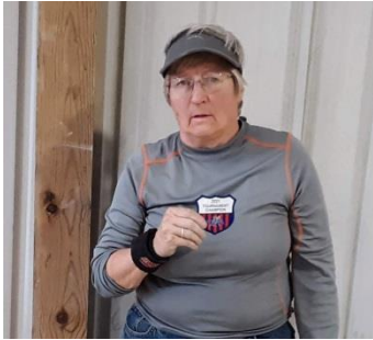
12-18-21 CR CLA 1 st Stanford