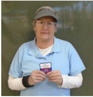
2-19-22 CR CLA 1 st Stanford